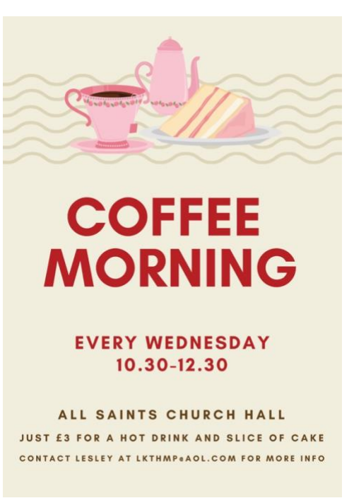
Happy 1<sup>st</sup> Birthday to our Wednesday Coffee Morning.

Sunday 20<sup>th</sup> – Dedication Lunch and 'NHWS Sunday'